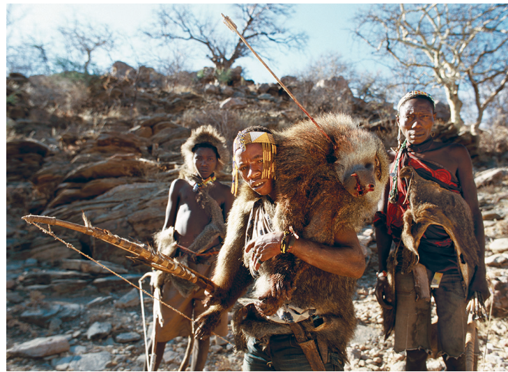
HADZA HUNTER-GATHERERS in Tanzania spend hundreds of calories a day on activity yet burn the same total number of calories as city dwellers in the U.S.

Another intriguing possibility is that the body makes room for the cost of additional activity by reducing the calories spent on the many unseen tasks that take up most of our daily energy budget: the housekeeping work that our cells and organs do to keep