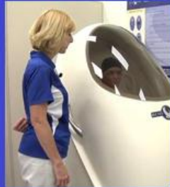
Body Composition, BODPOD