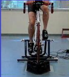
Sport Motion Analysis

Sports Performance Center | (352) 273-7371