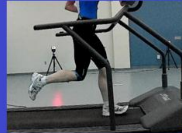
Nutrition &amp; Exercise Consults